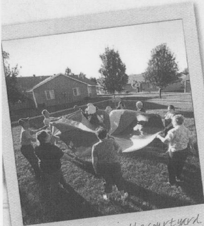
Parachute play in the courtyard.

bierocks, bratwurst, a polka band and carnival rides. Clients, staff and their families take part in the fun.